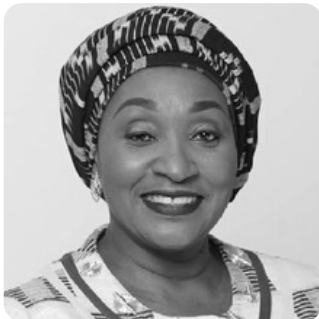
Dr. Raymonde GOUDOU COFFIE Minister Governor Côte d'Ivoire