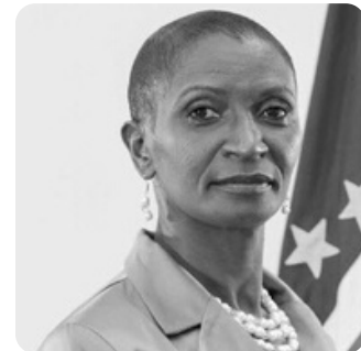
Ms. Filomena GONCALVES Minister of Health Cape Verde