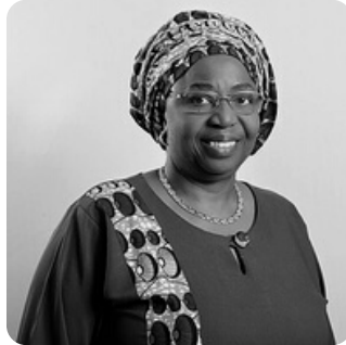
Prof. Awa Marie COLL-SECK Minister of State to the to the President of the Republic of Senegal