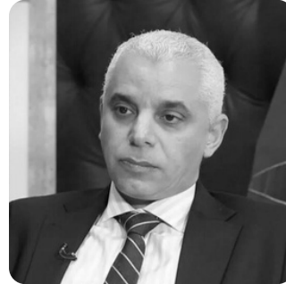
Prof. Khalid AIT TALEB Minister of Health and Social Protection of the Kingdom of Morocco